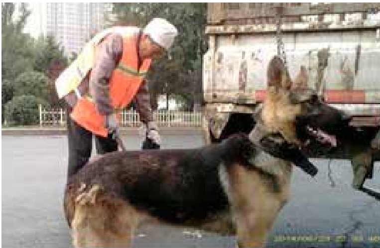
FIG 21: A German shepherd sold for the dinner table.