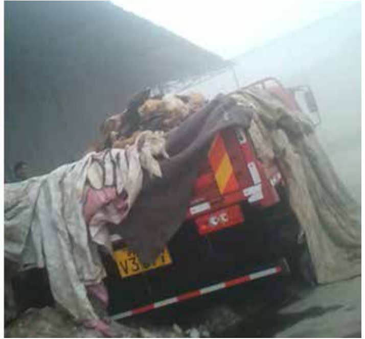
FIG 5: Dead dogs being unloaded at the door of the freezer in Pei county Deppon Express Station. FIG 6: Delivery truck loaded with dead dogs that will be covered with canvas during transit.