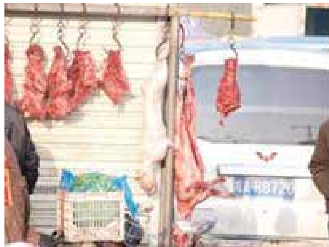
FIG 49-50: In 2011, business was booming in every dog meat shop at Zhougudui Market, Hefei City.