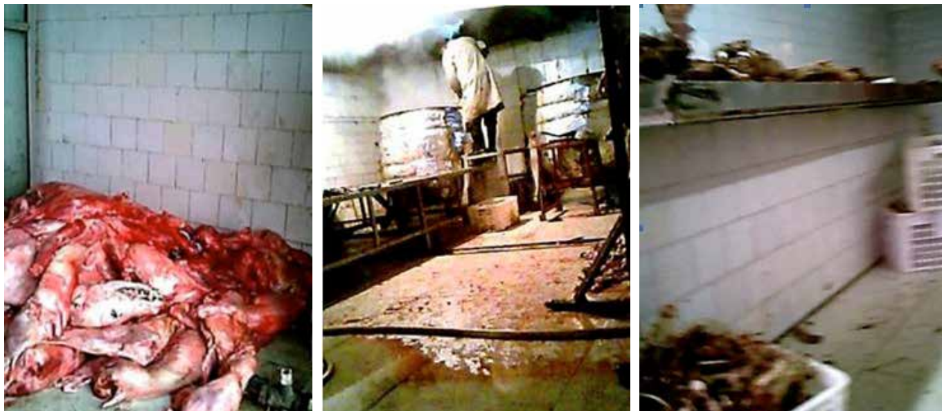
FIG 59: Slaughtered dogs were piled on the filthy floor.