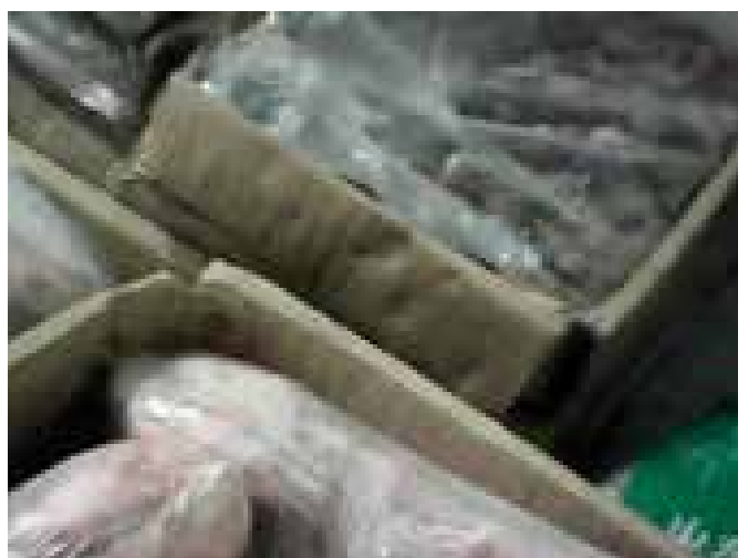
FIG 47-48: The meat was found to be labelled illegally.