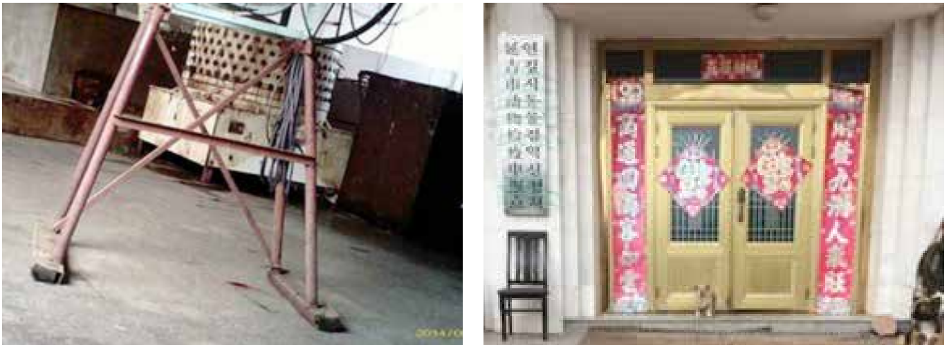
FIG 29: The slaughter room was empty, and seemed to have been closed for some time.