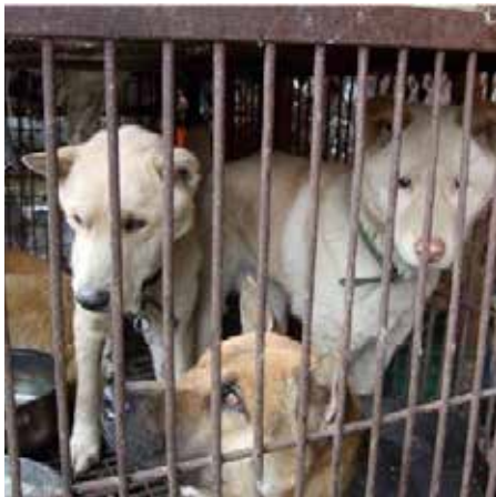
FIG 14: Many of the dogs at Pachong market were wearing pet collars.