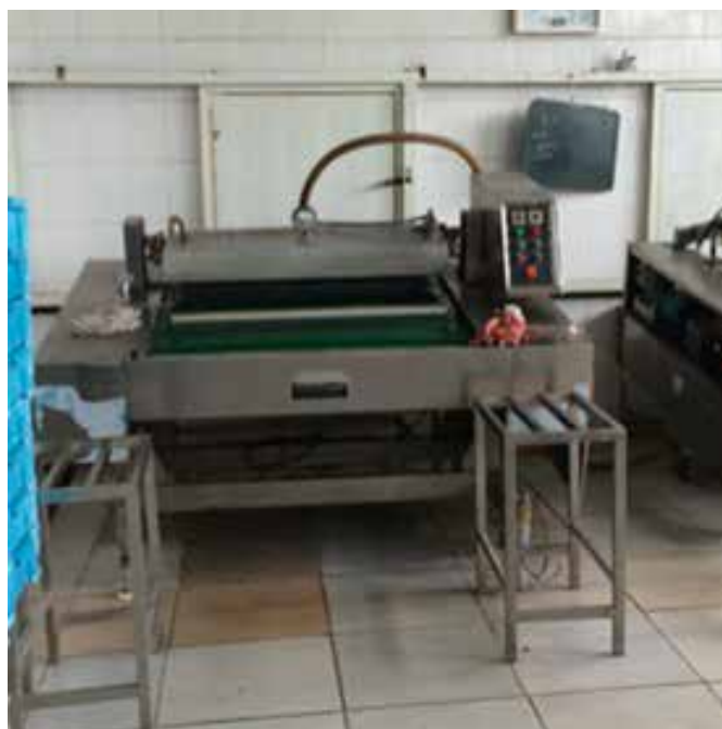
FIG 62-63: The workshop is empty and covered with thick dust, obviously shut down for some time.

When we first visited Hanxutang in 2011, we found that this enterprise was the largest among the dog meat product enterprises we had investigated. But when we visited again in 2014, we found that the factory was empty, and the situation in the workshop was almost the same as Hanliubang: clean, no obvious bad smell, and covered with dust. The next day, when we came here again, we found some administrative staff in the office building, and a male worker told us the industry was now strictly monitored, even the freezer car would be checked. He said there was no supply of goods and a lot of other companies here had also shut down. During the conversation, he mentioned that there was no meat dog farm, and the dogs had been collected from households.