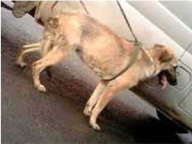
FIG 19: A dog with obvious symptoms of disease is sold for meat.