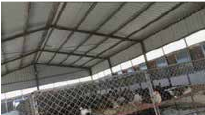
FIG 2: Pup house at a breeding farm in Jiexiang County.

From the information we collected online about meat dog farms, we targeted Jiexiang County, Shandong, which was advertised as the most concentrated dog-raising area and also “the core of Shandong’s livestock raising area” 5 . When we searched “meat dog breeding in Jiexiang County” on Baidu there were 1,690,000 results, but fewer than 50 meat-dog farms provided any searchable information.