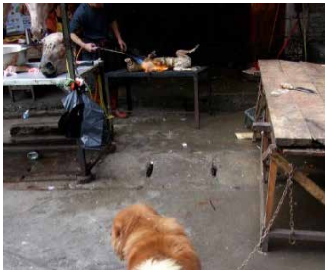
FIG 45-46: The owner's pet dog was forced to witness a dead dog having its fur removed.

In another shop in the market, we found a dog on a metal shelf being depilated, and the boss's pet dog was tied up at the other side of the shop, watching the scene. At first the boss claimed the animal was a fox, but later he admitted that it was actually a dog. When we took a closer look at the dog, we found no bruise or cuts on its head, neck or body, leading us to suspect that it had been poisoned or died from disease.