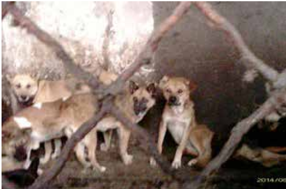
FIG 24: Dog fur and faeces were all over the floor and walls.