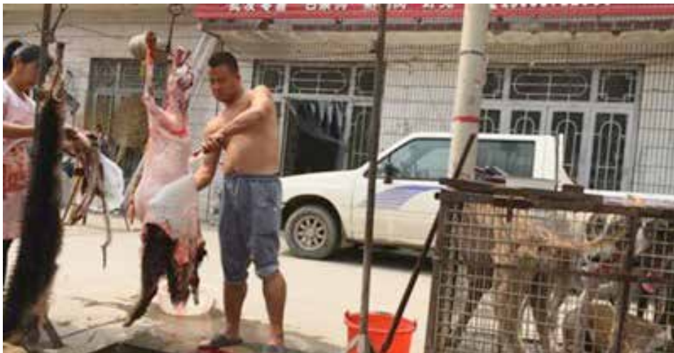
FIG 42: The dog was still twitching and shaking as it was being skinned.