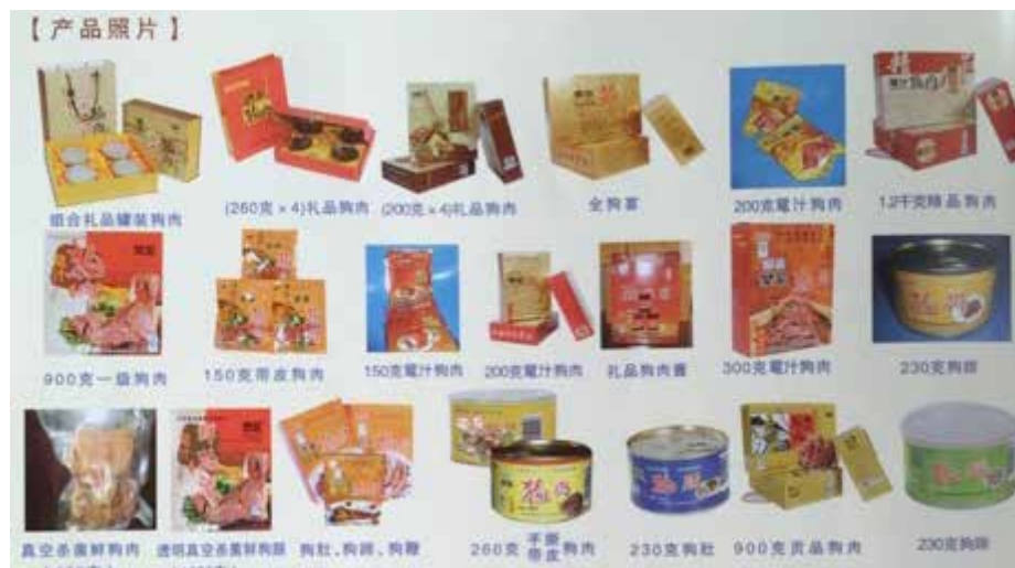
FIG 4: According to its brochure, Fankuai offers 24 dog-meat products.

Apart from specialised dog breeding farms/bases, there were also some dog meat food companies that claimed to have their own breeding farms as the source of their products. So, we visited the most well-known dog meat company in Pei county – Fankuai Dog Meat Products Co, Ltd. This company had been claiming to the public and the media that all its meat came from its own farms, and that Fankuai was “a leading enterprise that specialises in meat dog breeding, dog meat processing, and dog meat catering” 6 . We visited this company twice, in 2011 and 2014.