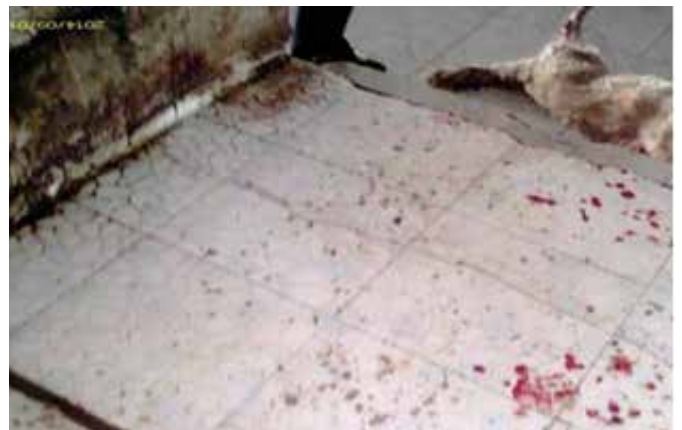
FIG 33: The chosen golden retriever is forcibly dragged by the butcher out of the doghouse. FIG 34: The slaughter room is very dirty, with blood and filth all over the floor.