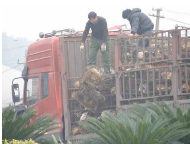
FIG 12: The truck was carrying hundreds of dogs crammed together into cages.