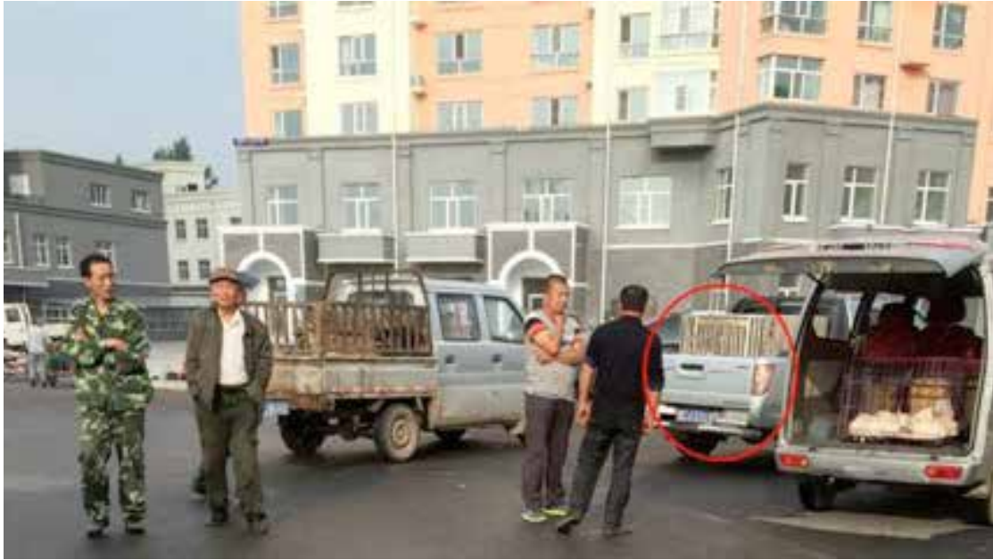
FIG 18: The red circle marks the tail of the pick-up truck that collects the dogs; the vehicle on the left belongs to the seller, and the vehicle on the right belongs to a dealer who sells pet dogs.