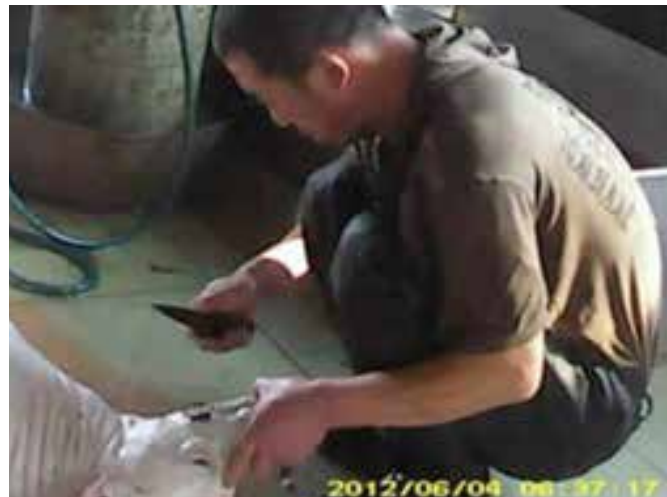
FIG 26: An employee works on the corpse of a dog on the grimy, blood-covered floor.

The manager of the slaughterhouse assured us that quarantine certificates were obtained for all dogs, adding that “if it’s not quarantined, we will be fined”. However, in our two visits, we saw no evidence of this. We also learned that the operators injected water into the dogs to boost the weight of the meat as required by customers.