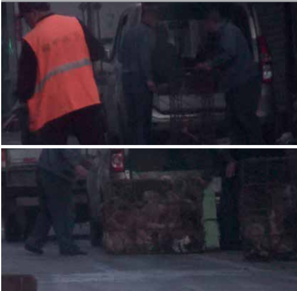
FIG 56-57: It was not yet 5am, and the peace of the street had been broken by dogs' terrible screams.

We learnt from residents nearby that vehicles deliver frozen dogs or live dogs every morning. The residents said they greatly disliked these shops. The daily unloading and slaughter were very noisy, and the stench was disgusting. There were schools nearby, and elementary school students or kindergarten children passed by the bloody scene regularly.