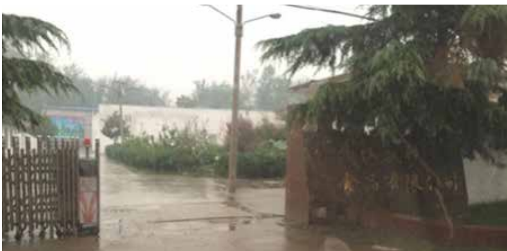
FIG 58: The big factory was empty in 2014.

According to Hanliubang's website, the company was founded in 1995 and specialises in the development and production of meat products. Its main products include soft-packaged dog meat, donkey meat, frozen skinned dogs, skinned chicken, ducks, beef, etc. The company covers an area of 8,000sqm, has over 120 employees, and its annual value of production is 20 million RMB.