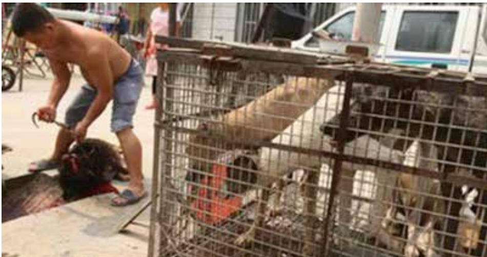
FIG 41: The restaurant owner slaughters a mixed-breed Tibetan mastiff on the street right in front of other terrified dogs. The dog was stunned and then its throat was cut, immediately attracting a large number of flies.