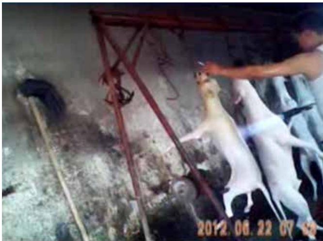
FIG 25: There is no quarantine at all before slaughter. This worker is even operating while smoking.