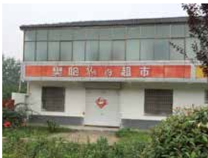
FIG 64: The front gate of Fankuai