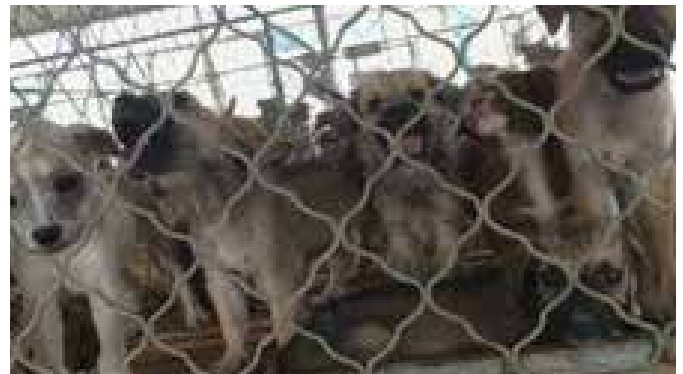
FIG 3: We saw only a few pups at a farm claiming to be large-scale.

Among these, the Wanda Dog Breeding Farm was relatively large, and its business mode was described as such: the breeding farm supplies “pups” and the mother dogs are from nearby peasant households, not from the farm. The farm has only a few stud dogs on display. The rest are transferred to the peasant households to be raised free-range until they are big enough to sell for meat. At this stage, the household can choose to let the dog farm buy back the adult dogs or sell them directly themselves. Here we saw only 20-30 adult dogs and hundreds of pups.