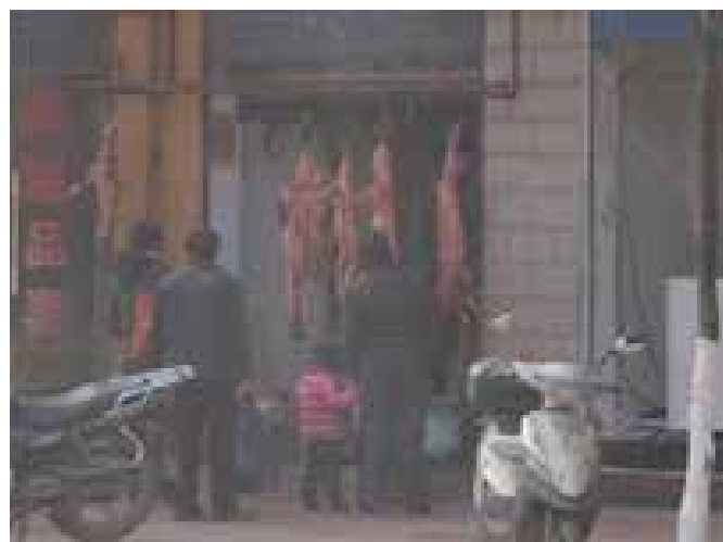
FIG 51-52: When we revisited in 2014, all dog meat shops inside the market had closed. There was just one left outside the market.

We learned that at the end of 2013 the Hefei Municipal Health Supervision Institute cracked down on the dog slaughterhouses and dog meat stalls in Hefei market, and many shops were closed. Meanwhile, the media also issued calls for the public to help inform on illegal dog slaughter workshops. (Related media reports: Illegal Dog Meat Workshop Opens “Chain Stores” in Zhougudui, Hefei 28 ). This shows that the government’s strengthened supervision and the media’s active appeals have brought real change.