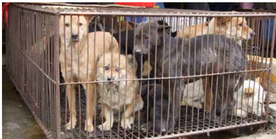
FIG 1: Millions of dogs are slaughtered for their meat in China each year.

*Animals Asia is also working on the issue of cat meat consumption. For information about our work in China for cats, including our programme to promote trap, neuter, release (TNR) projects throughout the country, please go to our website: www.animalsasia.org