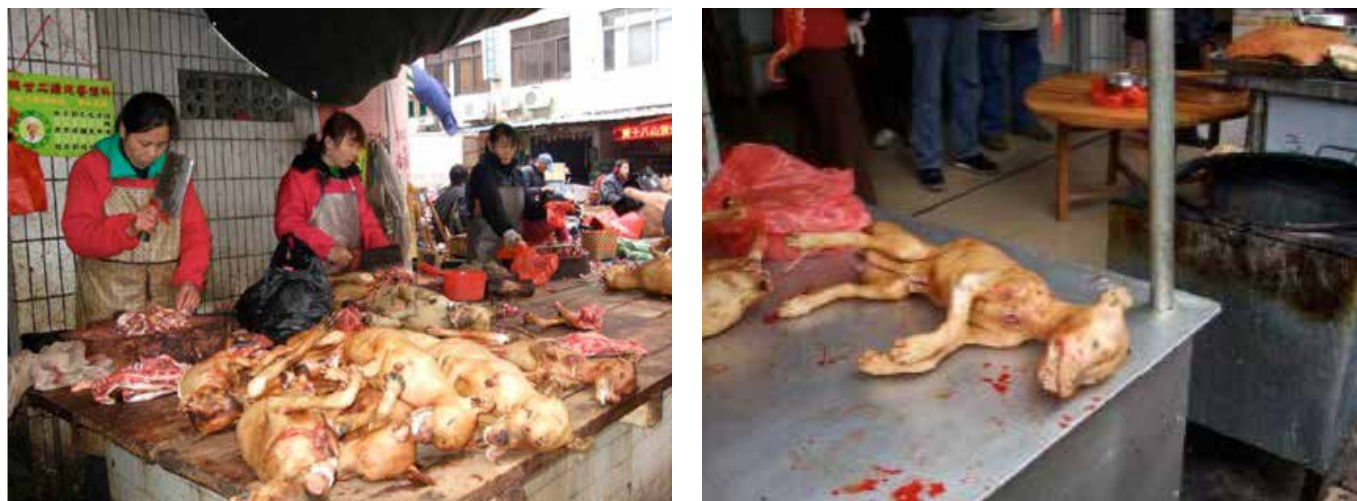
FIG 43-44: The dogs on sale were smaller than we would expect if they were bred on a farm for their meat.

In 2011, we visited two farmers’ markets and several dog meat restaurants in Yulin City, and as to the source of the dogs, most operators were vague, saying that the dogs were from places far away.