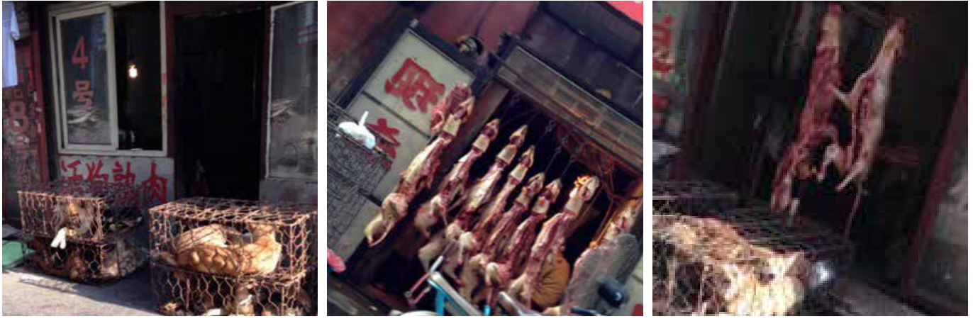
FIG 53: Crammed into tiny cages, these dogs will be slaughtered on demand.