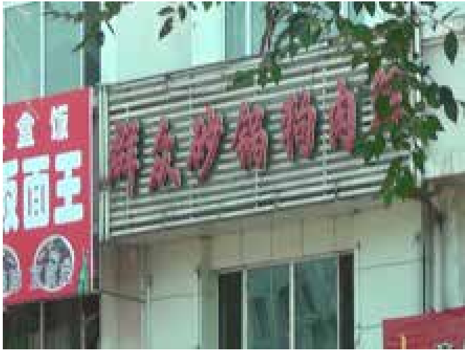
FIG 39: Fresh Dog Meat Casserole restaurant has been running for more than 20 years.