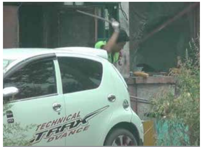
FIG 37: Dogs are dragged out of the cage with iron tongs one by one.