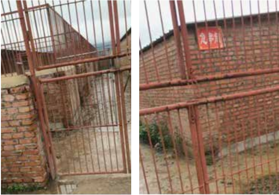
FIG 27-28: Most of the doghouses were empty, with fewer than 10 dogs left.