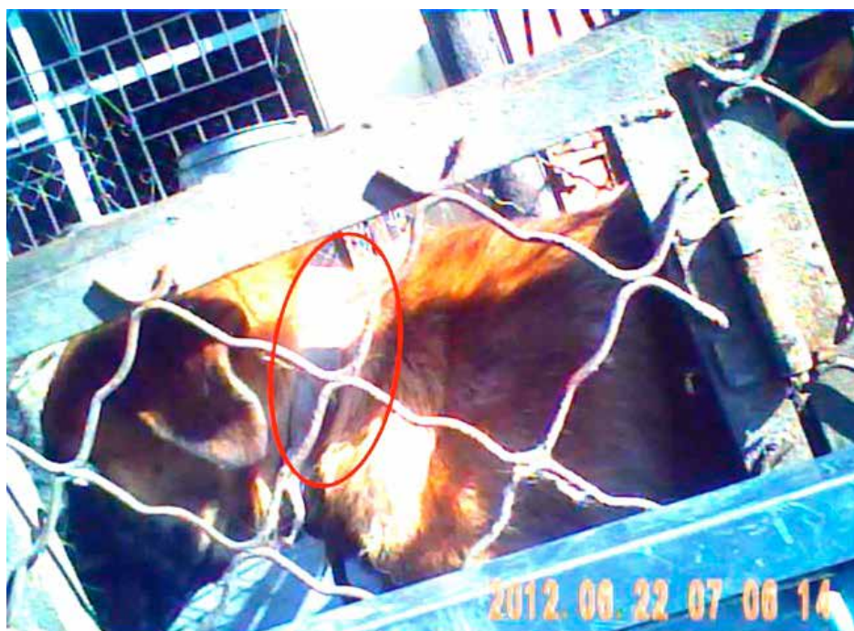
FIG 23: Newly arrived dog at Junlai Slaughterhouse was wearing collar.

We visited this dog slaughterhouse twice and found the slaughter methods and conditions in which the dogs were kept appalling. The stench was overwhelming, faeces lay all over the floor, dogs were in shockingly poor health, and the slaughter method was cruel, with other animals pending slaughter often watching their cage mates die. These dogs were clearly distressed, whining and trembling. The slaughterhouse was equipped with cameras at the door and indoors, which showed the industry's increasing caution.