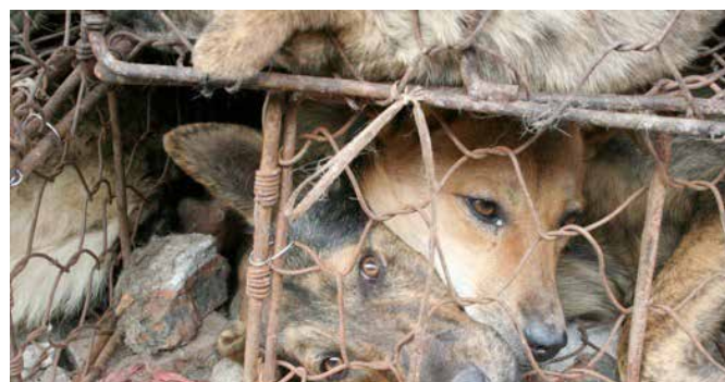
FIG 10: A rusty transport vehicle covered in dog fur and blood loaded with a mass of cages.